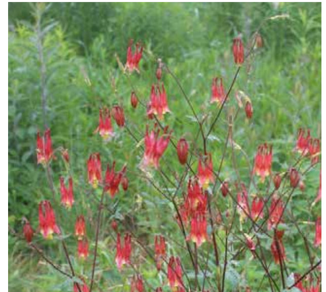
Red Columbine spring