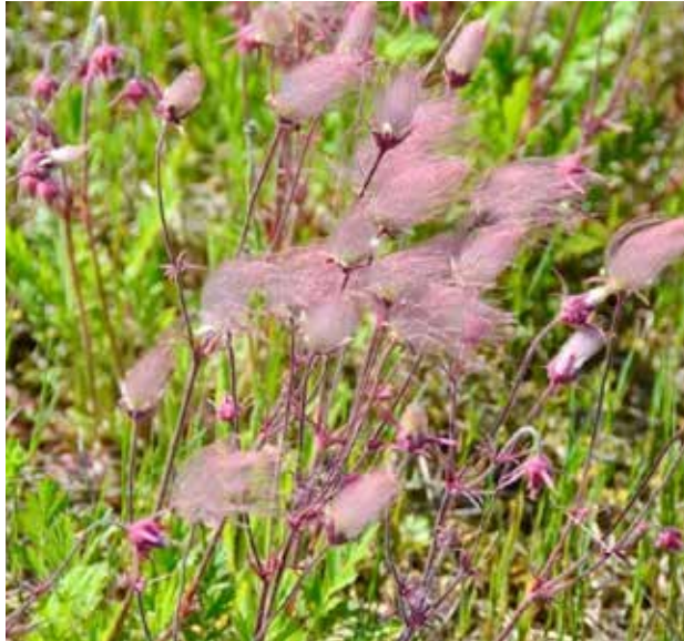
Prairie Smoke spring