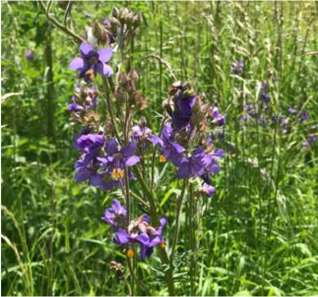
Blue Jacobs Ladder spring