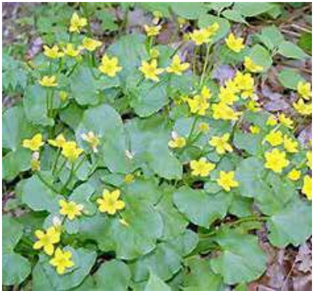
Marsh Marigold spring (in stream)