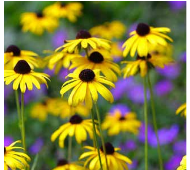
Black Eyed Susan summer