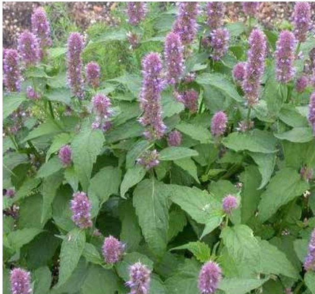
Lavender Hyssop summer