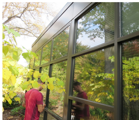
Solyx Bird Safety film covers the entire glass surface of this building at the Bronx Zoo.