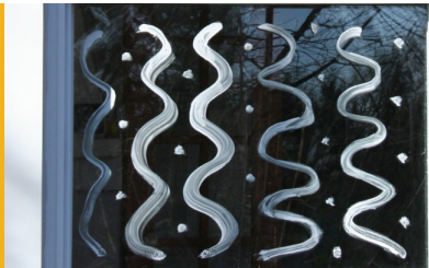
Tempera paint is a washable, long-lasting, and non-toxic solution to preventing bird/window collisions.